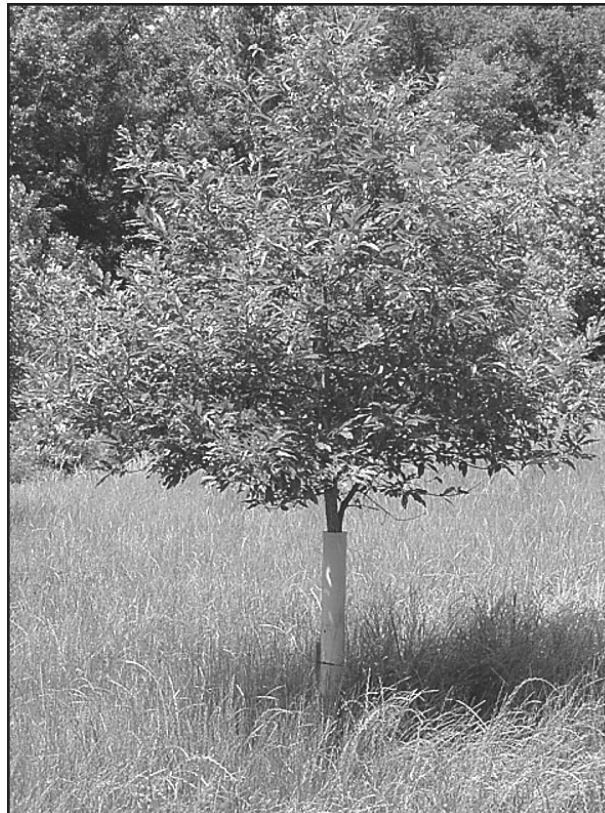
Sawtooth oaks are used extensively in wildlife plantings. They produce acorns at an early age compared to many native oak species.

Hard mast includes acorns, beechnuts, chestnuts, hickory nuts and pecans, and among these annual crops, the acorn is most critical in the diet of white-tailed deer. Acorns are especially important in areas of poor soil, which does not otherwise provide quality browse. And often in the South, it is the fall of acorns that relieves the stress of late summer heat, drought, and reduced forage, which results from these conditions. The carbohydrates in acorns provide the fat and energy which will be needed by all deer