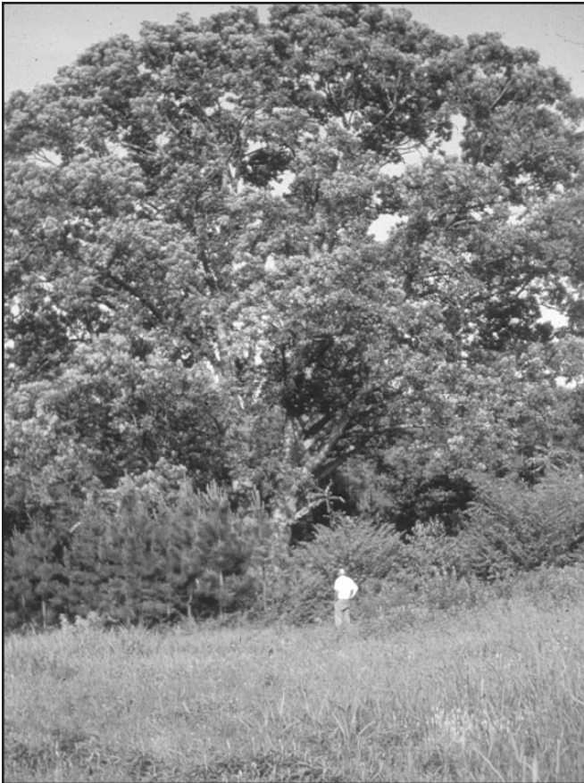
A large open grown oak will have a well developed canopy and can be fertilized to produce more acorns.

of breeding age in the upcoming rut. In addition, the acorn's fibrous component prepares the whitetail's digestive system for the leaner, more fibrous browse, which is often the only browse available in the winter ahead.